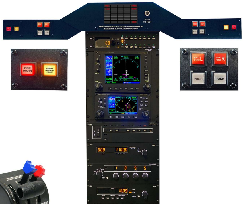
Standard Avionics with Master Caution System and Annunciator