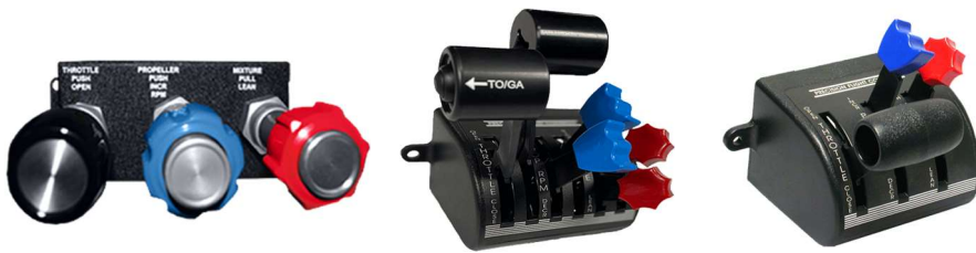
Interchangeable Throttle Quadrants, 13 Types Available