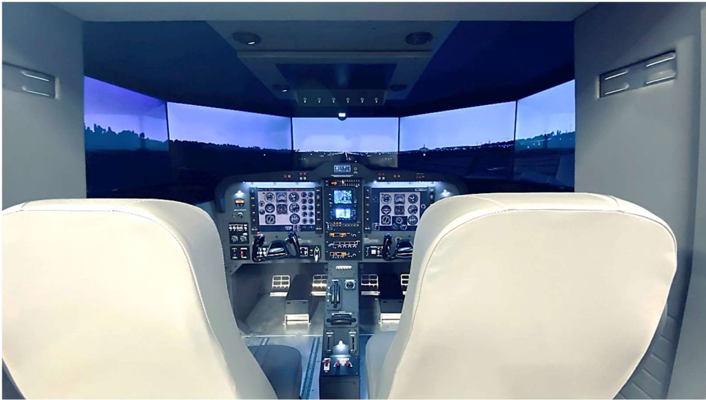
Two Hundred Degree High Resolution Visual System