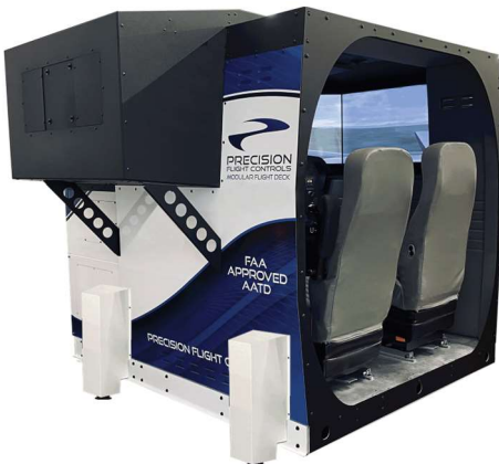
Shown With Optional 3-4 DOF Motion