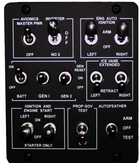
Type Specific Interchangeable Master Starter Panels for Jet and Turboprop