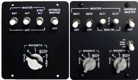
Type Specific Master Starter Panels for SEL, MEL, Turboprop and JET Aircraft