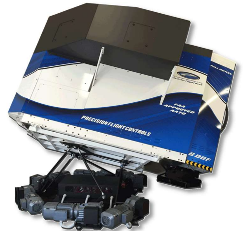
Shown With Optional 6DOF Motion Base

All Aluminum/Steel Construction All Electric Commercial Grade 3-4DOF Motion or 6DOF Motion