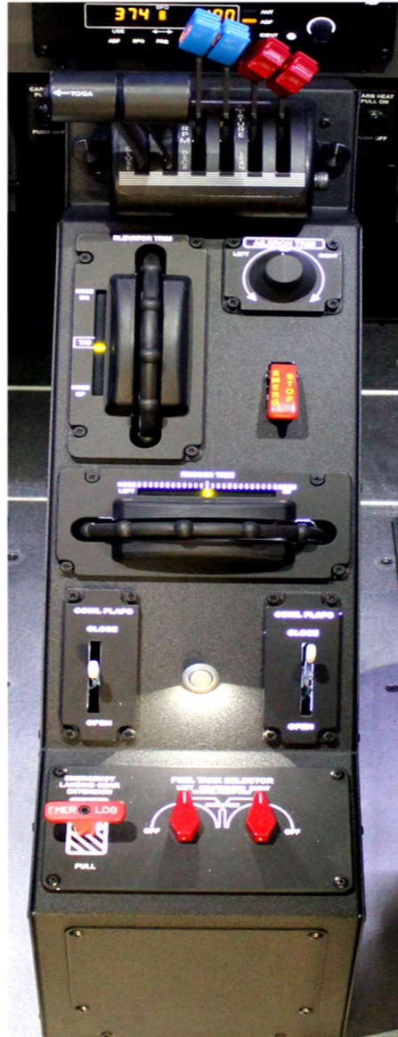
Elevator, Rudder and Aileron Trim Fuel Tank Selectors, Cowl Flaps and Emergency Landing Gear Extension