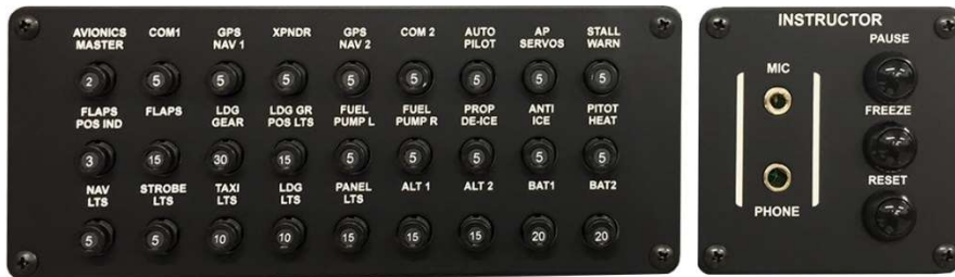
Active Circuit Breaker Pane and Intercom Panels