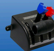
Comes With Both Single Engine and Multi-Engine Throttle Quadrants