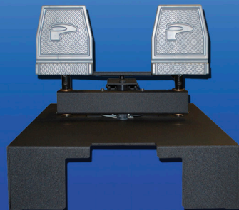
Cirrus Rudder Pedals With Proportional Toe Braking

Cast Aluminum-yoke 2 Axis Control Loading 5 Styles Available Beechcraft Cessna Mooney Saab 340 Boeing 737 Panel Lights NAV Taxi Strobe Landing Prop Sync ALT Air Switch Pitot Heat Anti-Ice Elevator Trim Electric And Manual Operation Couples To Autopilot Landing Gear Switch With Gear Position Lights Fuel Selector Panel Dual Fuel Tank Selectors Fuel Boost Pump Switches Guarded Flap Switch Cowl Flap Controls Interchangeable Throttle Quadrants (over 22 types including vernier style) SEL MEL Turboprop Jet Carb Heat Controls Instructor's Controls Pause Freeze Reset